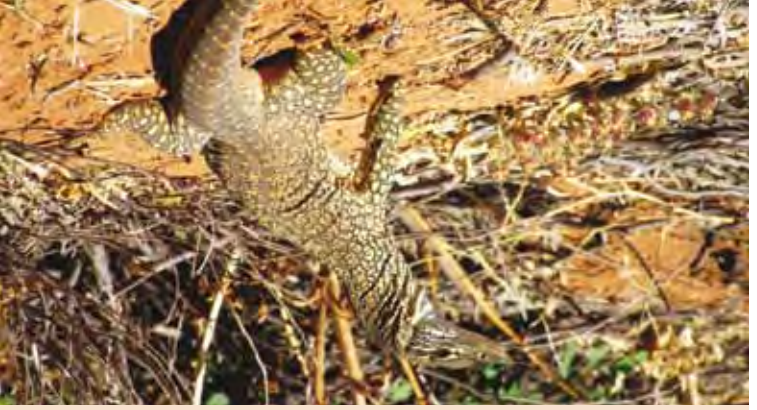
Below Bungarra (Gould's goanna).

fees are used to maintain and develop park facilities. box is located at the park entrance off Monkey Mia Road. Your Entrance and camping fees apply. A self-registration fee collection